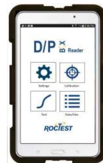
DP Box Main Menu